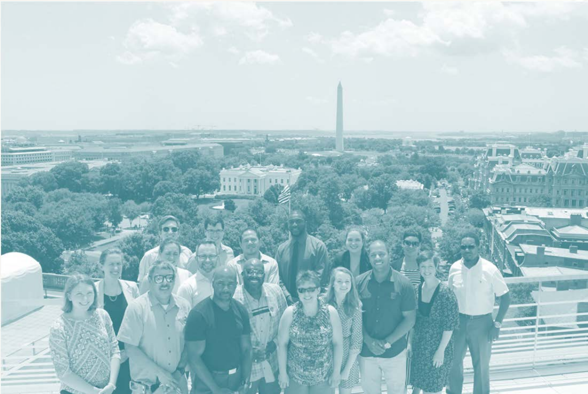
Campaign staff and ICAN members. 2016.

Dedicated to those still serving life-without-parole sentences for crimes they committed as children.